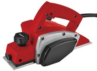
EP570 570 W

Rated Input Power: 570W No load Speed: 15000r/min Drilling Capacity: 82x1mm Rated Voltage: 220~240V Rated Frequency: 50/60Hz