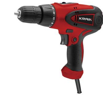
TD004-1/-2 280 W

Rated Input Power: 280 W No load Speed I: 0-750 r/min No load Speed II: 0-550/0-1100r/min Drilling Capacity: 10mm Rated Voltage: 220~240V Rated Frequency: 50/60Hz