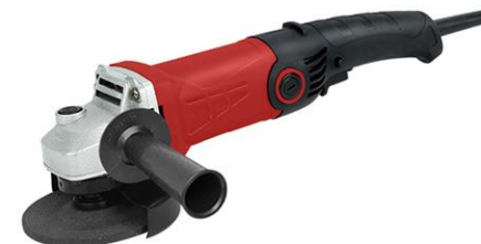
AG9556L 850 W

Rated Input Power: 850 W No load speed: 11000 r/min Disc size: 100/115/125mm Rated Voltage: 220~240V Rated Frequency: 50/60Hz