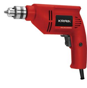
ZED005 500 W

Rated Input Power: 500 W No load speed: 0-3000 r/min Drilling Capacity: 10mm Rated Voltage: 220~240V Rated Frequency: 50/60Hz