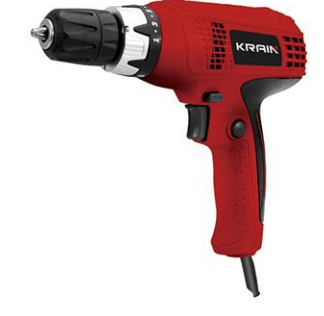
TD006 280 W

Rated Input Power: 280 W No load speed: 0-750 r/min Drilling Capacity: 10mm Rated Voltage: 220~240V Rated Frequency: 50/60Hz