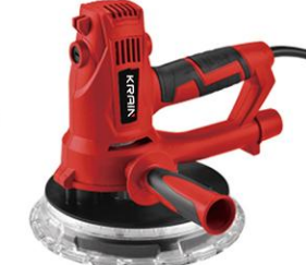
DWS950 950 W

Rated Input Power: 950W No load Speed: 1100~2150r/min Disc size: 180mm Rated Voltage: 220~240V Rated Frequency: 50/60Hz