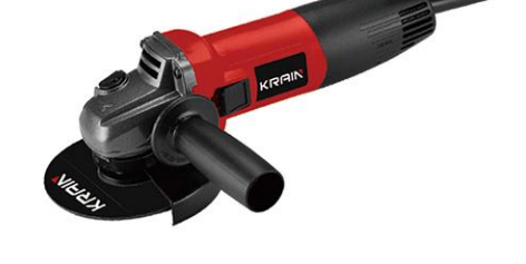
AG001 780 W

Rated Input Power: 780 W No load speed: 11000 r/min Disc size: 100/115/125mm Rated Voltage: 220~240V Rated Frequency: 50/60Hz