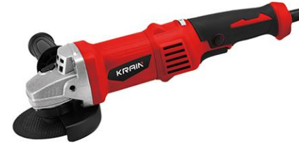
AG9512B 950 W

Rated Input Power: 950 W No load speed: 11000 r/min Disc size: 100/115/125mm Rated Voltage: 220~240V Rated Frequency: 50/60Hz