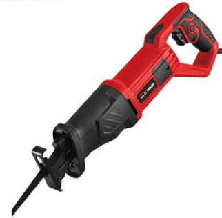
RS750-22 750 W

Rated Input Power: 750 W No load Speed: 0-2800 r/min Stroke length: 22mm Rated Voltage: 220~240V Rated Frequency: 50/60Hz