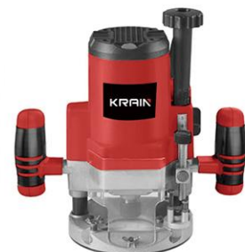
ER3612C 2400 W

Chuck Diameter: 12mm(1/2") Rated Input Power: 2400W No-Load Speed: 9000-23500/min Rated Frequency: 60Hz Rated Voltage: 220-240V~