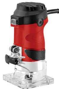
ER3706 550 W

Chuck Diameter: 6.35mm Rated Input Power: 550W No-Load Speed: 30000/min Rated Frequency: 50Hz Rated Voltage: 230V~