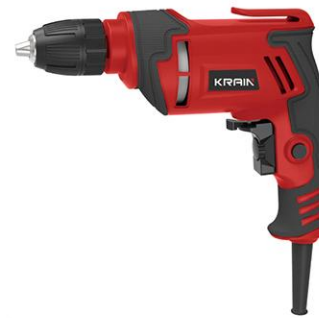
ZED006 500 W

Rated Input Power: 500 W No load speed: 0-3000 r/min Drilling Capacity: 10mm Rated Voltage: 220~240V Rated Frequency: 50/60Hz