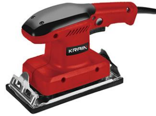
FS180 180 W

Base Plate Size: 93x185mm Rated Input Power: 180W No load Speed: 10000r/min Rated Voltage: 220~240V Rated Frequency: 50/60Hz