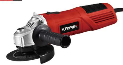
AG005 600 W 710 W 850 W

Rated Input Power: 600 W / 710 W / 850 W No load speed: 11000 r/min Disc size: 100/115/125mm Rated Voltage: 220~240V Rated Frequency: 50/60Hz