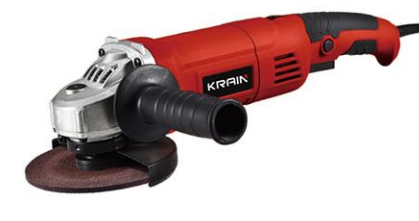
AG006 1100 W

Rated Input Power: 1100 W No load speed: 11000 r/min Disc size: 115/125/150mm Rated Voltage: 220~240V Rated Frequency: 50/60Hz