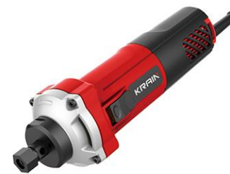
DG721 550 W

Collet Diameter: 6mm Rated Input Power: 550W No-Load Speed: 5500-30000r/min Rated Frequency: 50/60Hz Rated Voltage: 220-240V~