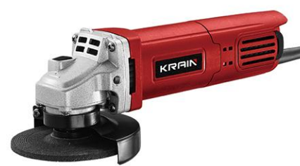
AG008 900 W

Rated Input Power: 900 W No load speed: 11000 r/min Disc size: 100/115/125mm Rated Voltage: 220~240V Rated Frequency: 50/60Hz