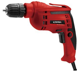
ZED001 500 W

Rated Input Power: 500 W No load speed: 0-3000 r/min Drilling Capacity: 10mm Rated Voltage: 220~240V Rated Frequency: 50/60Hz