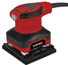
FS240 240 W

Base Plate Size: 100x110mm Rated Input Power: 240W No load Speed: 16000r/min Rated Voltage: 220~240V Rated Frequency: 50/60Hz