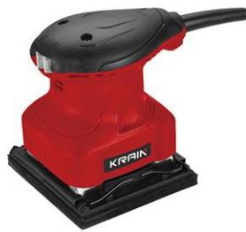
FS230 230 W

Base Plate Size: 100x110mm Rated Input Power: 230W No load Speed: 14000r/min Rated Voltage: 220~240V Rated Frequency: 50/60Hz