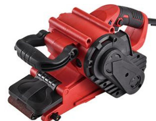
S1T-ZS-76 1050 W

Rated Input Power: 1050W No-load Speed: 0-2800r/min Sand paper size: 76x533mm Rated Voltage: 220-240V Rated Frequency: 50-60Hz