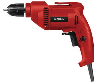
ZED004 500 W

Rated Input Power: 500 W No load speed: 0-3000 r/min Drilling Capacity: 10mm Rated Voltage: 220~240V Rated Frequency: 50/60Hz