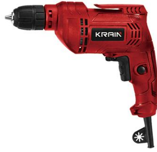
ZED007 500 W

Rated Input Power: 500 W No load speed: 0-3000 r/min Drilling Capacity: 10mm Rated Voltage: 220~240V Rated Frequency: 50/60Hz