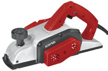
EP650 650 W

Rated Input Power: 650W No load Speed: 16000r/min Drilling Capacity: 90x2mm Rated Voltage: 220~240V Rated Frequency: 50/60Hz