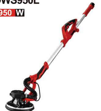
DWS950L 950 W

Rated Input Power: 950W No load Speed: 1100~2150r/min Disc size: 180mm Rated Voltage: 220~240V Rated Frequency: 50/60Hz