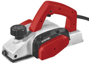
EP600 600 W

Rated Input Power: 600W No load Speed: 15000r/min Drilling Capacity: 82x1mm Rated Voltage: 220~240V Rated Frequency: 50/60Hz