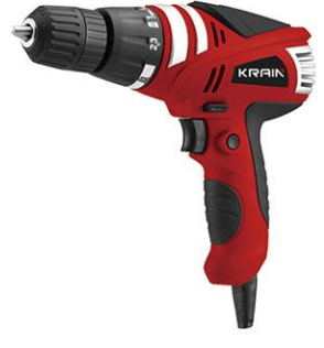
TD005 280 W

Rated Input Power: 280 W No load speed: 0-750 r/min Drilling Capacity: 10mm Rated Voltage: 220~240V Rated Frequency: 50/60Hz