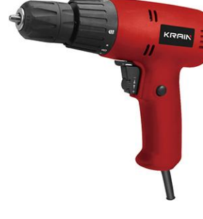
TD001 280 W

Rated Input Power: 280 W No load speed: 0-750 r/min Drilling Capacity: 10mm Rated Voltage: 220~240V Rated Frequency: 50/60Hz