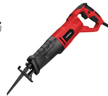
RS850-28 850 W

Rated Input Power: 850 W No load Speed: 0-2800 r/min Max Cutting Capacity: 28mm Rated Voltage: 220~240V Rated Frequency: 50/60Hz