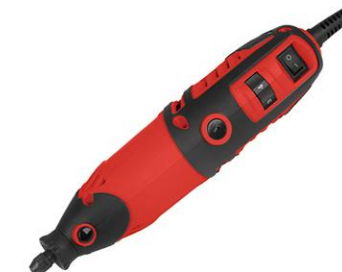
DG615 150 W

Collet Diameter: 3.2mm Rated Input Power: 150W No-Load Speed: 10000-32000r/min Rated Frequency: 50/60Hz Rated Voltage: 220-240V~