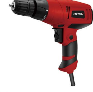
TD002-1/-2 280 W

Rated Input Power: 280 W No load Speed I: 0-750 r/min No load Speed II: 0-550/0-1100r/min Drilling Capacity: 10mm Rated Voltage: 220~240V Rated Frequency: 50/60Hz