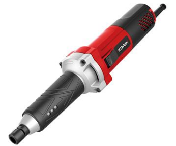
DG720 550 W

Collet Diameter: 6mm Rated Input Power: 550W No-Load Speed: 30000r/min Rated Frequency: 50/60Hz Rated Voltage: 220-240V~