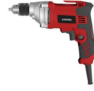
ZED003 550 W

Rated Input Power: 550 W No load speed: 0-3000 r/min Drilling Capacity: 10mm Rated Voltage: 220~240V Rated Frequency: 50/60Hz