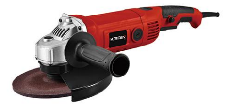
AG007 2100 W

Rated Input Power: 2200 W No load speed: 6500 r/min Disc size: 180/230mm Rated Voltage: 220~240V Rated Frequency: 50/60Hz