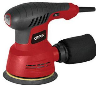
EOS560 560 W

Base Plate Size: 125mm Rated Input Power: 560W No load Speed: 0-3000r/min Rated Voltage: 220~240V Rated Frequency: 50/60Hz