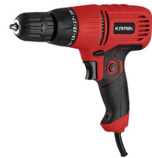
TD009 280 W

Rated Input Power: 280 W No load speed: 0-750 r/min Drilling Capacity: 10mm Rated Voltage: 220~240V Rated Frequency: 50/60Hz