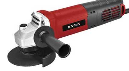
AG900 850 W

Rated Input Power: 850 W No load speed: 11000 r/min Disc size: 100/115/125mm Rated Voltage: 220~240V Rated Frequency: 50/60Hz